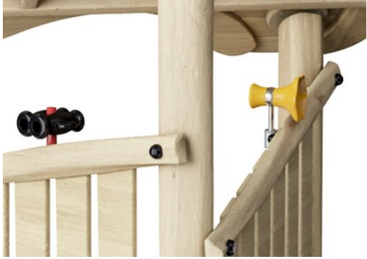
Play activities like the Megaphone are made of injection moulded high quality nylon (PA6). PA6 has good wearing and impact strength and is UV stabilised.