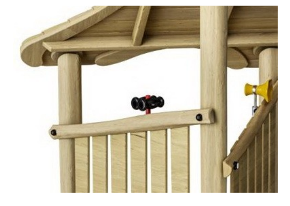
Binoculars are made of PUR. All components retain their properties in the temperature range of -30°C to 60°C. Material is UV stabilised.

Robinia products are available in three different wood treatment options: Untreated Robinia wood or brown painted with a pigment that maintains the wood colour and coloured version with paint of selected components.