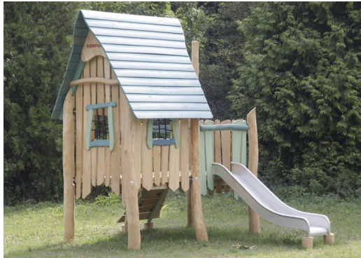
The product/activities are preassembled from the factory to ensure all safety requirements are considered.