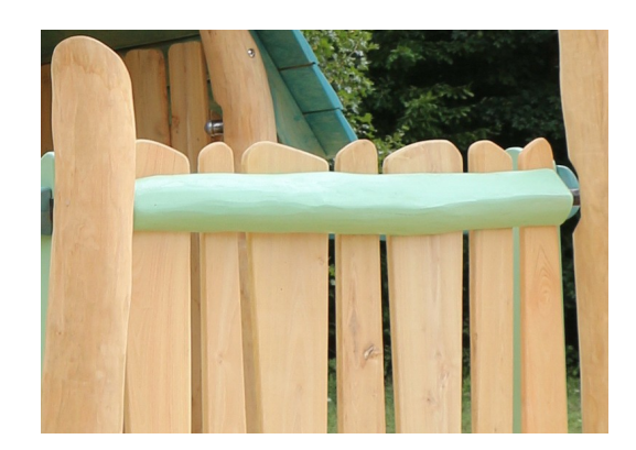
All Organic Robinia products by KOMPAN are made of Robinia wood from sustainable European sources. On request it can be supplied as FSC® Certified (FSC® C004450).