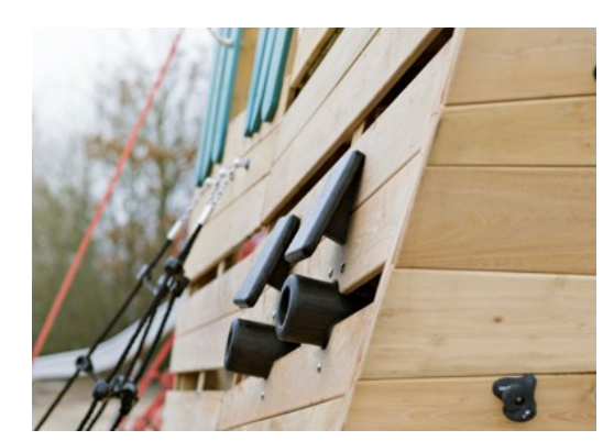
All Organic Robinia products by KOMPAN are made of Robinia wood from sustainable European sources. On request it can be supplied as FSC® Certified (FSC® C004450).