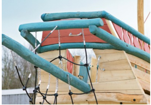
The Robinia products are designed with a KOMPAN colour concept with a number of different standard colours. The wood can also be supplied as untreated or with brown painted with a pigment that maintains the wood colour.