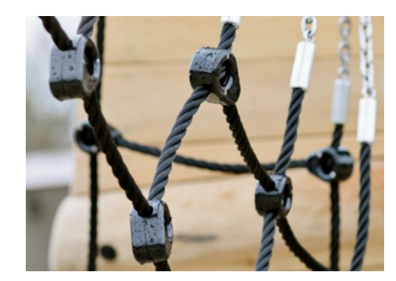
Nets and ropes are made of UV-stabilised PA with inner steel cable reinforcement. The rope is induction treated in order to create a strong connection between steel and rope which leads to good wear resistance.