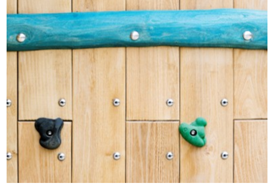
The hardware is made of stainless steel or galvanised steel to ensure durable connections with a high corrosion resistance.