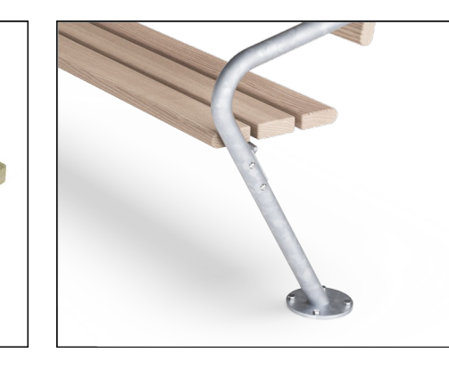
Bench is made of pine wood post pressure impregnated class AB with Tanalith E3475 according to EN335.

The steel surfaces are hot dip galvanized inside and outside with lead free zinc. The galvanization has excellent corrosion resistance in outdoor environments and require low maintenance. Painted steel parts are hot dip galvanized before powder coating.