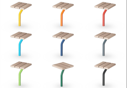
The Agora assortment is available in 2 wood types and 9 different frame colors to match the selected color scheme of the play, sport or fitness site.

Powder coated top finish on top of galvanization is processed in two steps: Light grinding and clean sweeping, powder coating - thickness 70-120 \mu m.