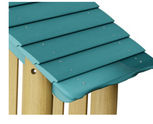
The paint used for coloured components is water based environmentally friendly with excellent UV resistance. The paint is in compliance with EN 71 Part 3.