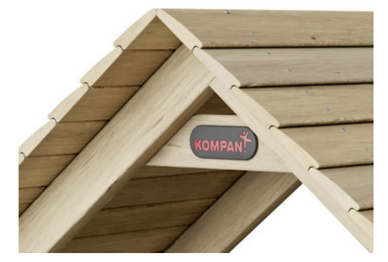
All Organic Robinia products by KOMPAN are made of Robinia wood from sustainable European sources. On request it can be supplied as FSC® Certified (FSC® C004450).