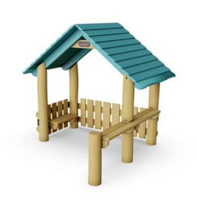
The product/activities are preassembled from the factory to ensure all safety requirements are considered.