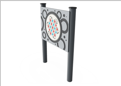
Round Ø100mm posts of extruded aluminum with powder coated top finish in black color and High-Density Polyethylene HDPE post cap