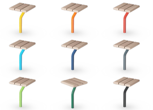
The Agora assortment is available as standard in 2 wood types and 9 different frame colors to match the selected color scheme of the play, sport or fitness site.

Powder coated top finish on top of galvanisation is processed in two steps: Light grinding and clean sweeping, powder coating - thickness 70-120 \mu m.