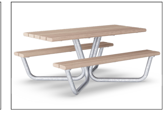
The furniture is a freestanding product with optional anchoring possibilities. Kompan has multiple anchoring's to fit specific requirements for individual customer projects. The anchoring is sold as separate modules.