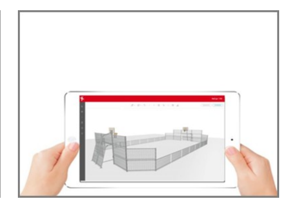
KOMPAN Multi Use Games Areas (MUGA) are designed as a flexible system. With the configurator you can easily change size, height, panels, entrances and goals to create a MUGA that fits your environment, budget and purpose.