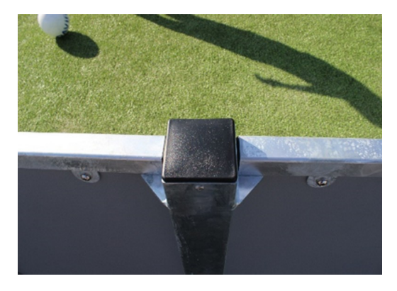
The posts are made of 80 \times 80 \times 3 mm profile with horizontally, 6mm welded flanges. This will enable an easy installation and strong construction. The low-density polyethylene post caps are attached with blind rivets.