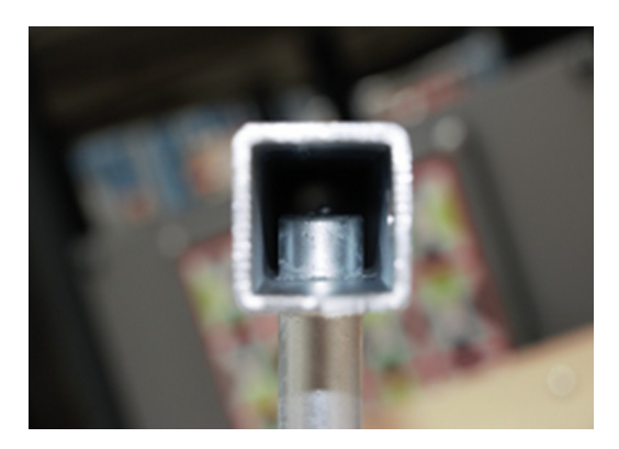
The Ø21.3 mm x 2 mm tubes are embedded in the steel panel which avoids cracks and prevent the tubes from braking out of the steel frame. Creating an extremely strong, vandalism proof solution.