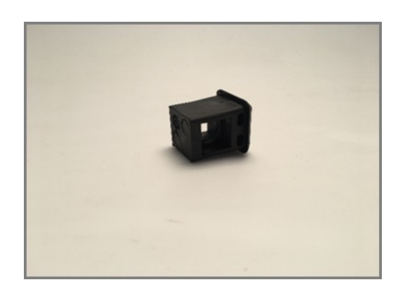
Each panel has 4 Thermoplastic Vulcanizates plugs connecting the panels to the posts. The plugs reduce the vibration and therefore reduce the noise level. The plugs will also simplify installation as the come with pre-assembled nuts.