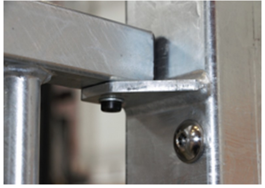
All steel components are manufactured from carbon steel, welding's according EN ISO 5817 & Hot dip galvanised (HDG) according to ISO1461. This process ensures good protection in all circumstances.