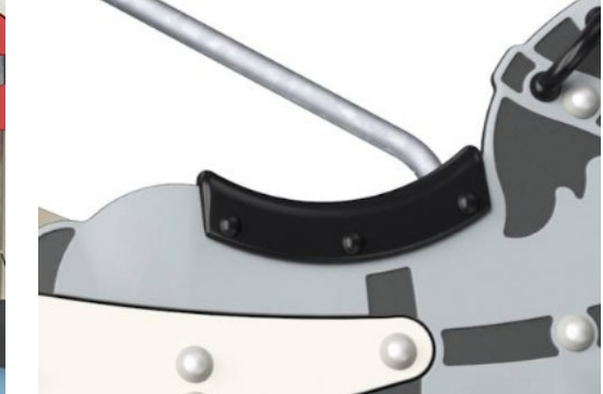
Saddle is made of PUR. It retains its properties in the temperature range of -30°C to 60°C. Material is UV stabilised.

The steel surfaces are hot dip galvanised inside and outside with lead free zinc. The galvanisation has excellent corrosion resistance in outside environments and requires low maintenance.