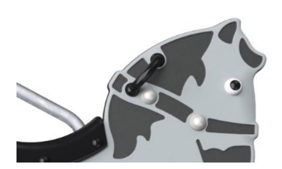
Handholds are made of injection moulded high quality nylon (PA6). PA6 has good wearing and impact strength.