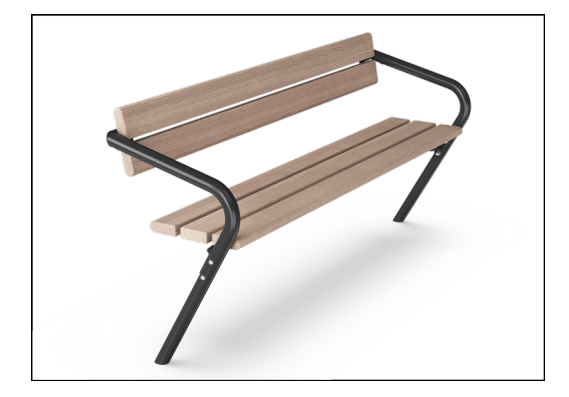
Powder coated top finish on top of galvanization is processed in two steps: Light grinding and clean sweeping, powder coating - thickness 70-120 \mu m .