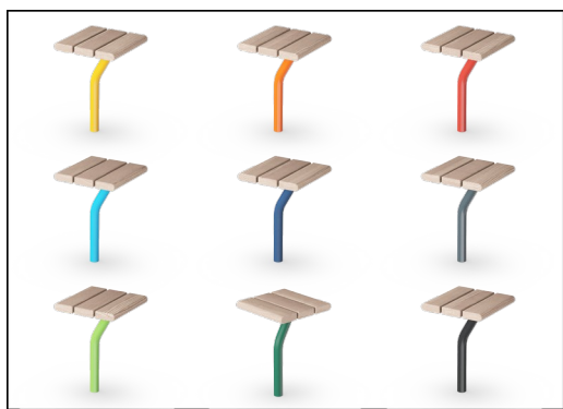
The Agora assortment is available in 2 wood types and 9 different frame colors to match the selected color scheme of the play, sport or fitness site.