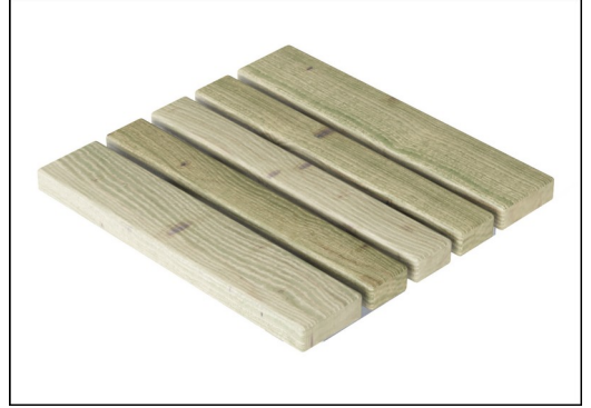
Bench is made of pine wood post pressure impregnated class AB with Tanalith E3475 according to EN335.