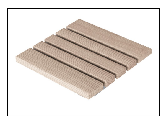
Boards are made of ash wood from sustainable European sources. The ash wood is thermo treated according to CEN/TS 15679, durability class 2 according EN350-2.