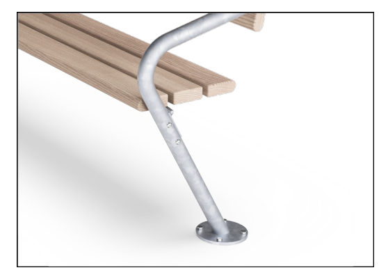
The steel surfaces are hot dip galvanized inside and outside with lead free zinc. The galvanization has excellent corrosion resistance in outdoor environments and require low maintenance. Painted steel parts are hot dip galvanized before powder coating.