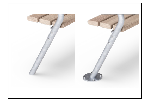
KOMPAN outdoor furniture is available for surface and in-ground installation. Surface installation involves anchoring to the base layer, and in-ground installation is direct in-ground or additional hot-dip galvanized steel brackets.