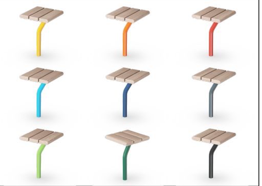
The Agora assortment is available as standard in 2 wood types and 9 different frame colors to match the selected color scheme of the play, sport or fitness site.

Powder coated top finish on top of galvanisation is processed in two steps: Light grinding and clean sweeping, powder coating - thickness 70-120 \mu m.