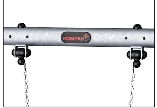
The swing hangers are made of high quality UVstabalized nylon (PA6) housing with integrated lifetime sealed ball bearings. The height adjustable chains are fixed by a stainless steel hook with theft proof snake-eye bolt in a turn able anti twist housing. All seats with two chain fixation are available with either standard or anti-wrap suspension.