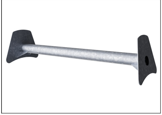
The A-Frame is designed with a hot-dip galvanized 100mm crossbar with large steel end plates for strong fixation to the posts. The crossbeam is prepared for all KOMPAN hanger options.