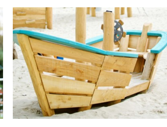
The paint used for coloured components is water based environmental friendly with excellent UV resistance. The paint is in compliance with EN 71 Part 3.

The Robinia products are designed with a KOMPAN colour concept with a number of different standard colours. The wood can also be supplied as untreated or with brown painted with a pigment that maintains the wood colour.