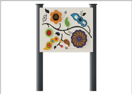
Panel and selected play parts made from High Density Polyethylene HDPE which is 100% recyclable after usage