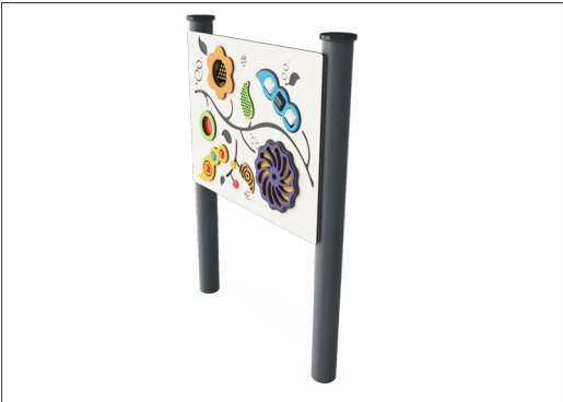
Round Ø100mm posts of extruded aluminum with powder coated top finish in black color and High-Density Polyethylene HDPE post cap