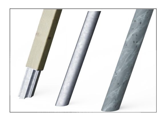
The A-Frame is available in three post-material options: Hot-dip galvanized 70mm steel, impregnated pine wood 95x95mm with hot dip galvanized steel footings, or 120mm TexMade ^{\text{TM}} posts.