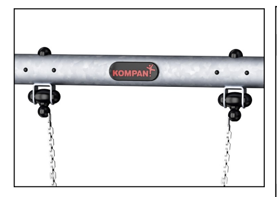
The swing hangers are made of high quality UV-stabalized nylon (PA6) housing with integrated lifetime sealed ball bearings. The height adjustable chains are fixed by a stainless steel hook with theft proof snake-eye bolt in a turn able anti twist housing. All seats with two chain fixation are available with either standard or anti-wrap suspension.