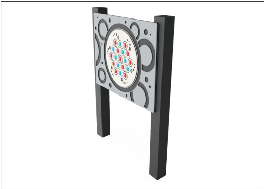
Square 100x100mm posts made of recycled plastic in black color