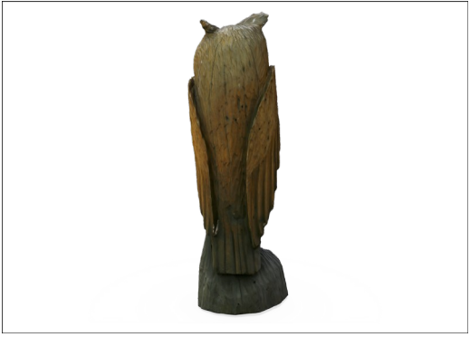
The Robinia wood can be supplied as untreated raw wood or painted with a brown colored transparent pigment that maintains the golden wood color of the wood.