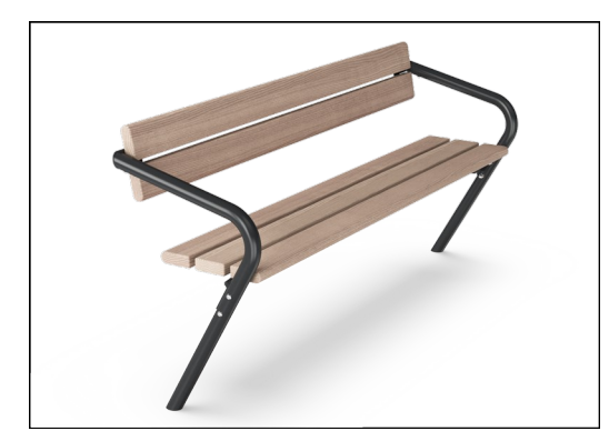
Powder coated top finish on top of galvanisation is processed in two steps: Light grinding and clean sweeping, powder coating - thickness 70-120 \mu m.