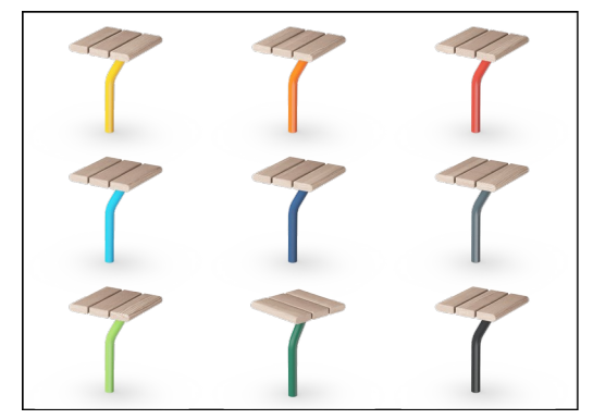
The Agora assortment is available as standard in 2 wood types and 9 different frame colors to match the selected color scheme of the play, sport or fitness site.