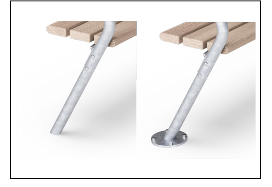
KOMPAN outdoor furniture is available for surface and in-ground installation. Surface installation by anchoring to base layer or inground installation as either direct in ground or additional hot dip galvanized steel brackets.